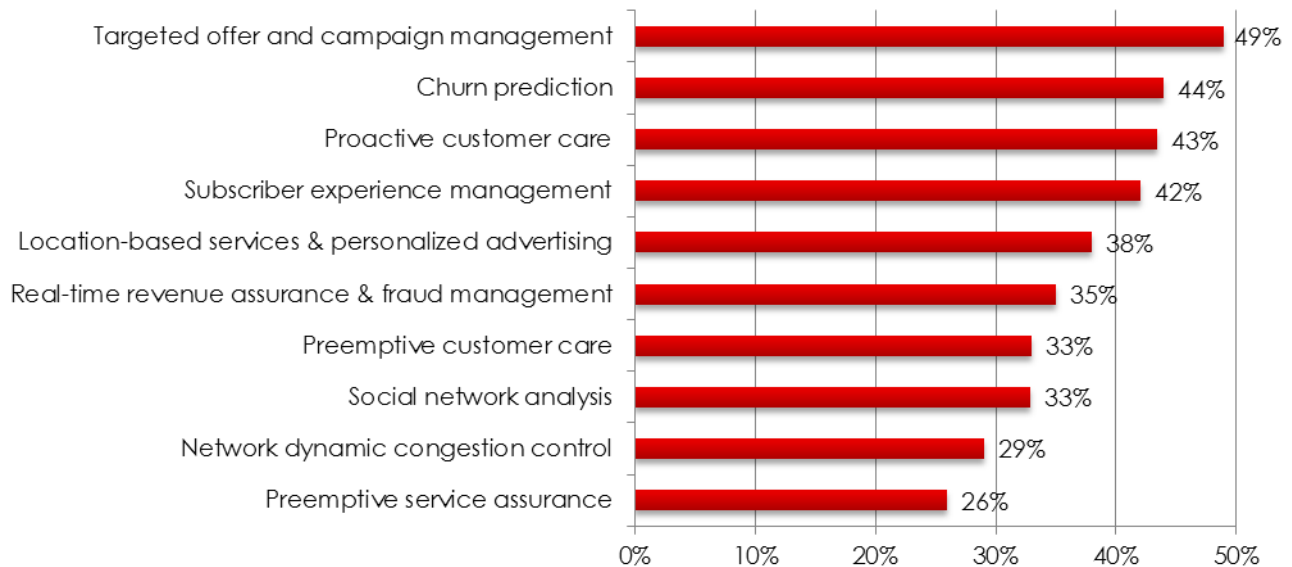
Figure 3: Critical Pain Points That Big Data & Streaming Analytics Can Address

Network lifecycle events have a large impact on customer satisfaction as there are many moving parts that can impact customer experience. Suboptimal network performance results in longer call center calls, more customer support costs and an unsatisfactory customer experience. Figure 3 , based on a recent Heavy Reading survey, points out some of the key use cases that can be tackled using streaming analytics over big data.